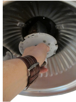
STEP 3: ROTATE BALLAST PLATE CLOCKWISE AND REMOVE