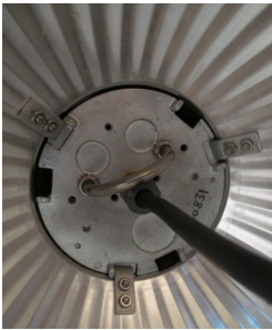
STEP 5: ROTATE DRIVE ASSEMBLY COUNTER CLOCKWISE TO LOCK IN PLACE