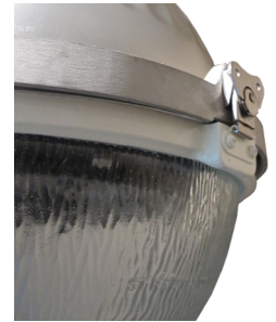
STEP 8: LATCH LENS INTO PLACE