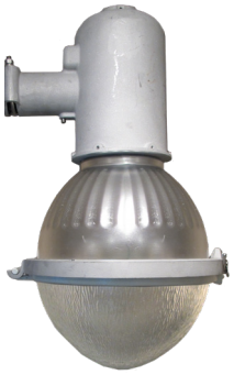
STEP 1: SELECT HID FIXTURE FOR CONVERSION TO LED