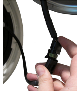
STEP 7: CONNECT DRIVE TO LED ENGINE