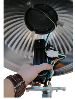
STEP 4: CONNECT LED DRIVER ASSEMBLY