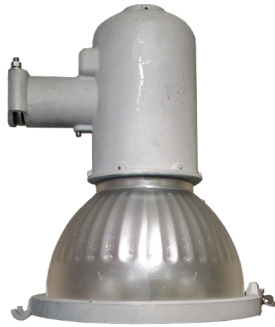
STEP 2: UNLATCH AND REMOVE LENS AND GASKET FROM SHROUD