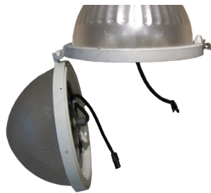
STEP 6: PLACE LENS ON HINGE AND APPLY NEW GASKET TO SHROUD